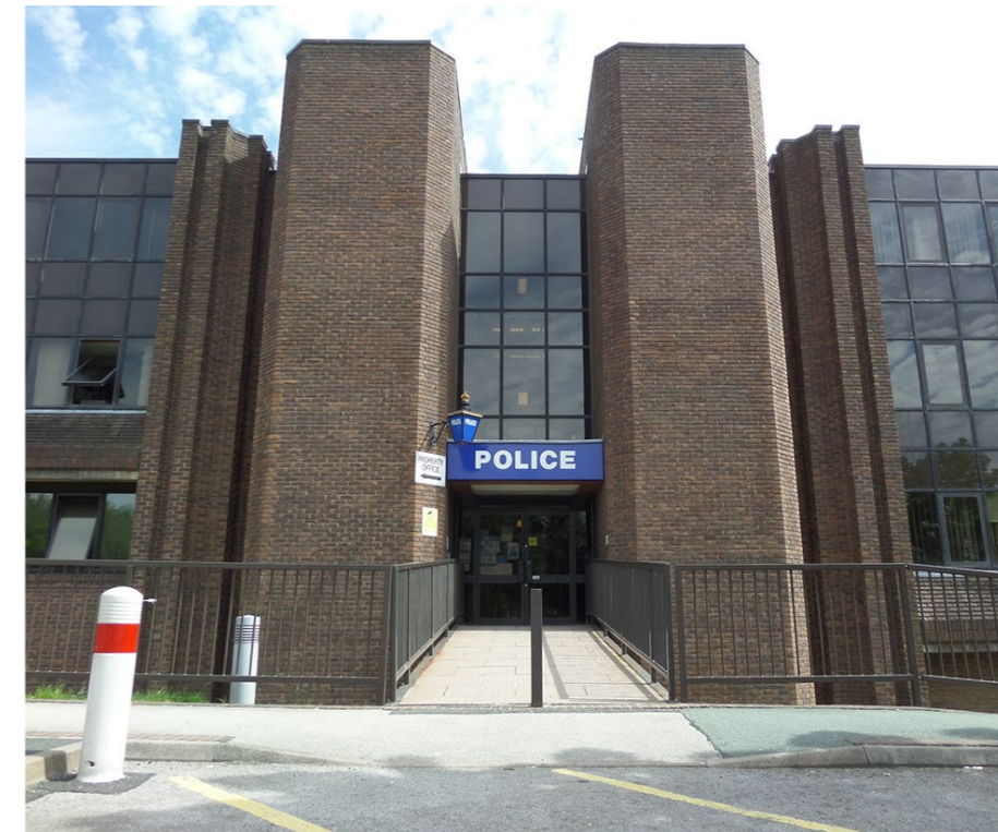
Metropolitan Police - Stable Refurbishments Multi-disciplinary services, including Design and Contract Administrator services as well as CDM for the full refurbishment of a Metropolitan Police stables and office facilities.