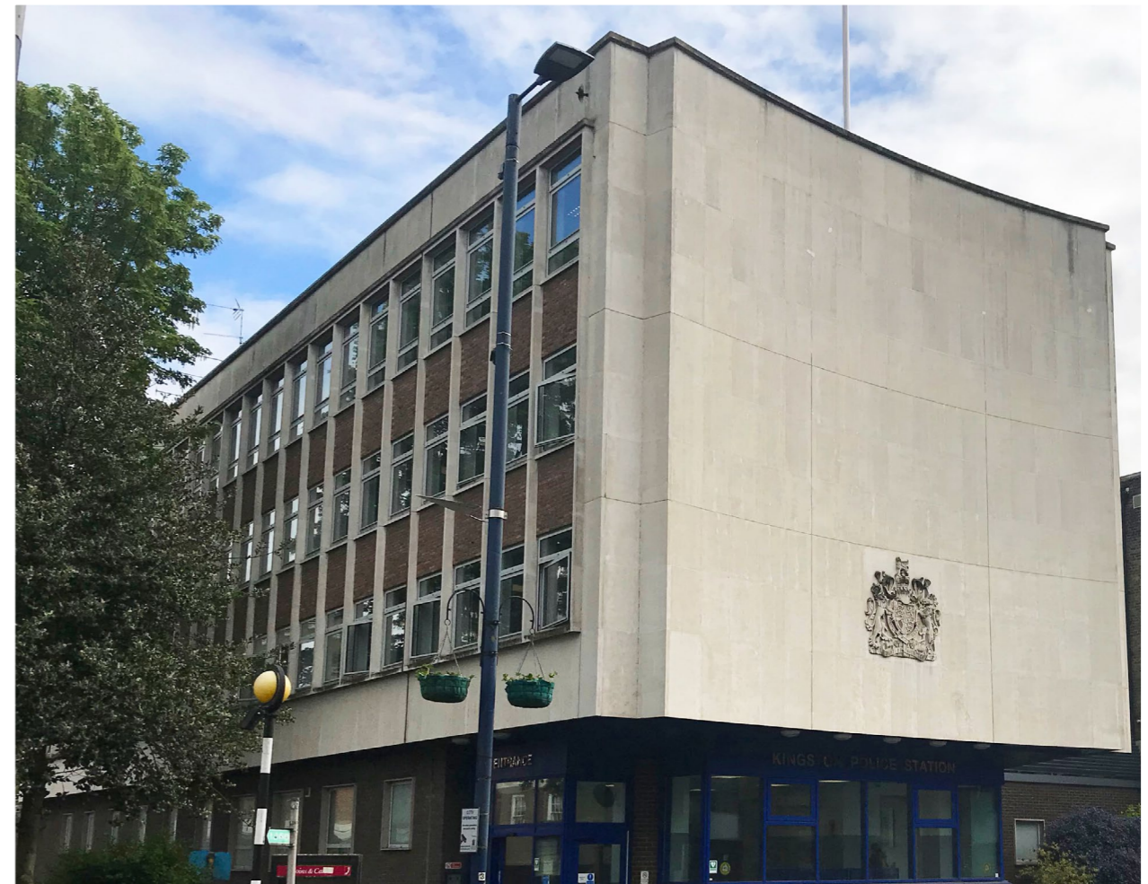
Kingston Police Station Lead Consultant and Multi Discipline Design Services for the station refurbishment, which forms part of the eight stations worked upon in the transformation of the Metropolitan Police Service Estate.