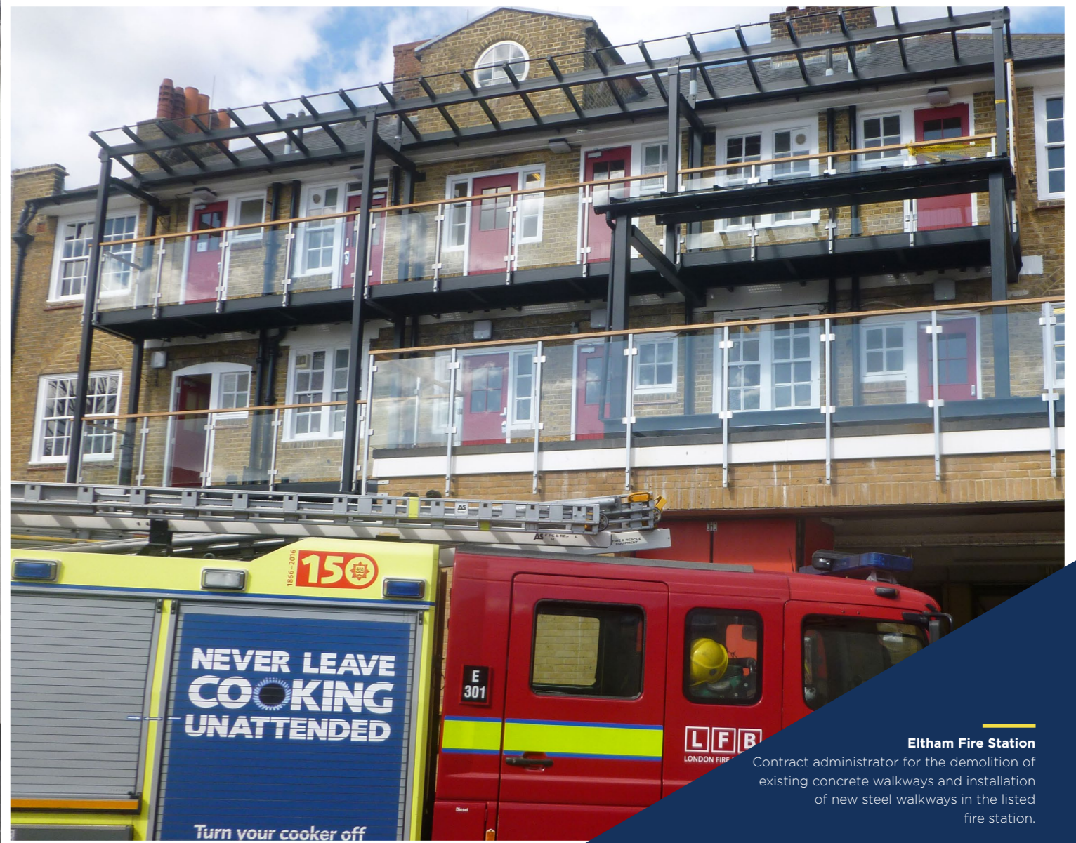
Eltham Fire Station Contract administrator for the demolition of existing concrete walkways and installation of new steel walkways in the listed fire station.

At Baily Garner we have experience working with a wide range of buildings including those within conservation areas and listed structures. We support Blue Light organisations in their identification, use, creation and disposal of property assets through three key areas: Performance, Design and Delivery.