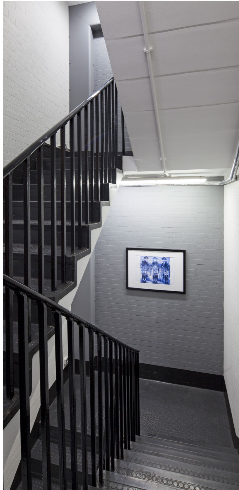
Metropolitan Police Station Refurbishment Lead Consultant and Multi Discipline Design Services on the refurbishment works to eight police stations across London.