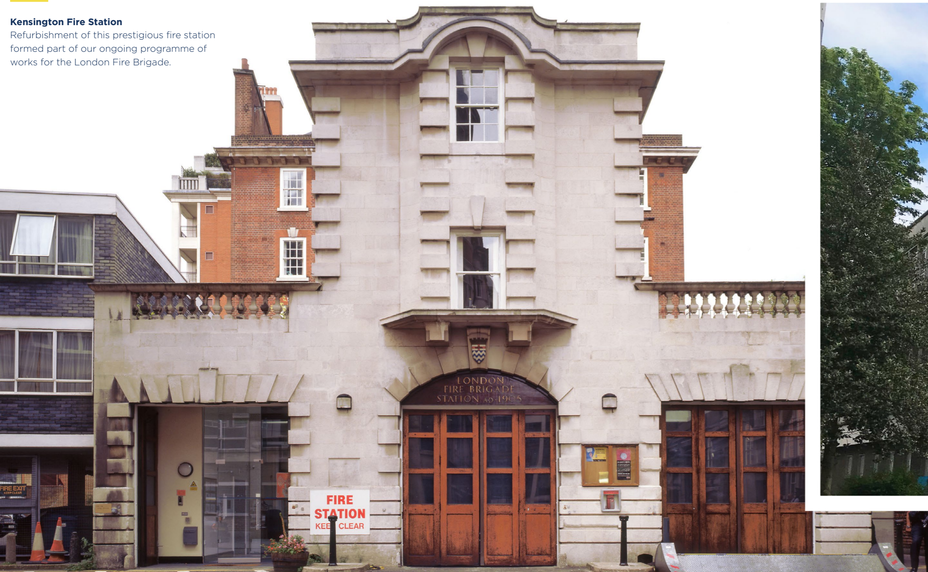
Kensington Fire Station Refurbishment of this prestigious fire station formed part of our ongoing programme of works for the London Fire Brigade.

Underlying advice on the performance of buildings, is our Asset Management expertise, enabling the collation, review, analysis and assessment of buildings to inform asset management strategies.