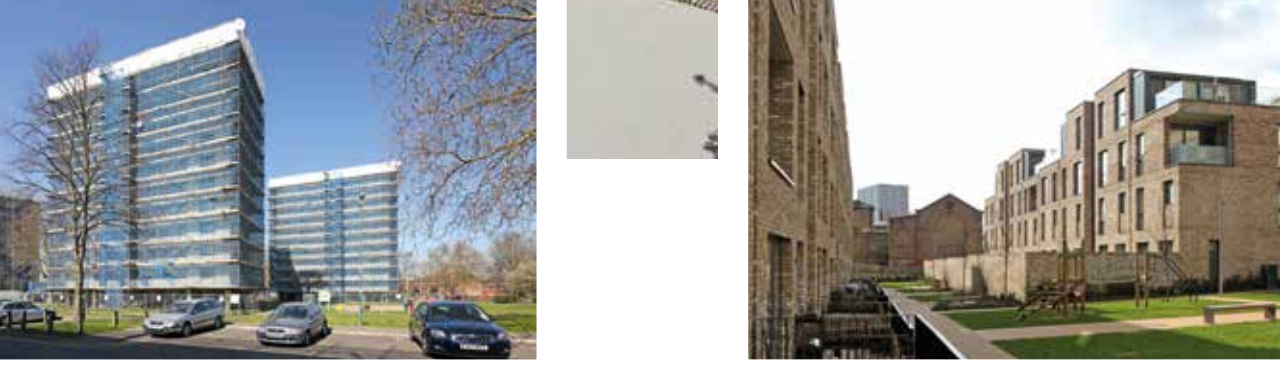
Leybridge and Newstead Estates, Lewisham. Refurbishment of over 400 homes carried out whilst residents remained in occupation. Architect: PRP.