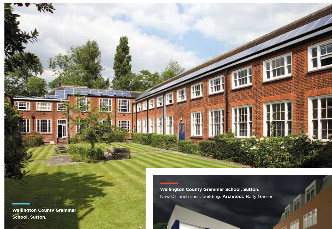
Wallington County Grammar School, Sutton.