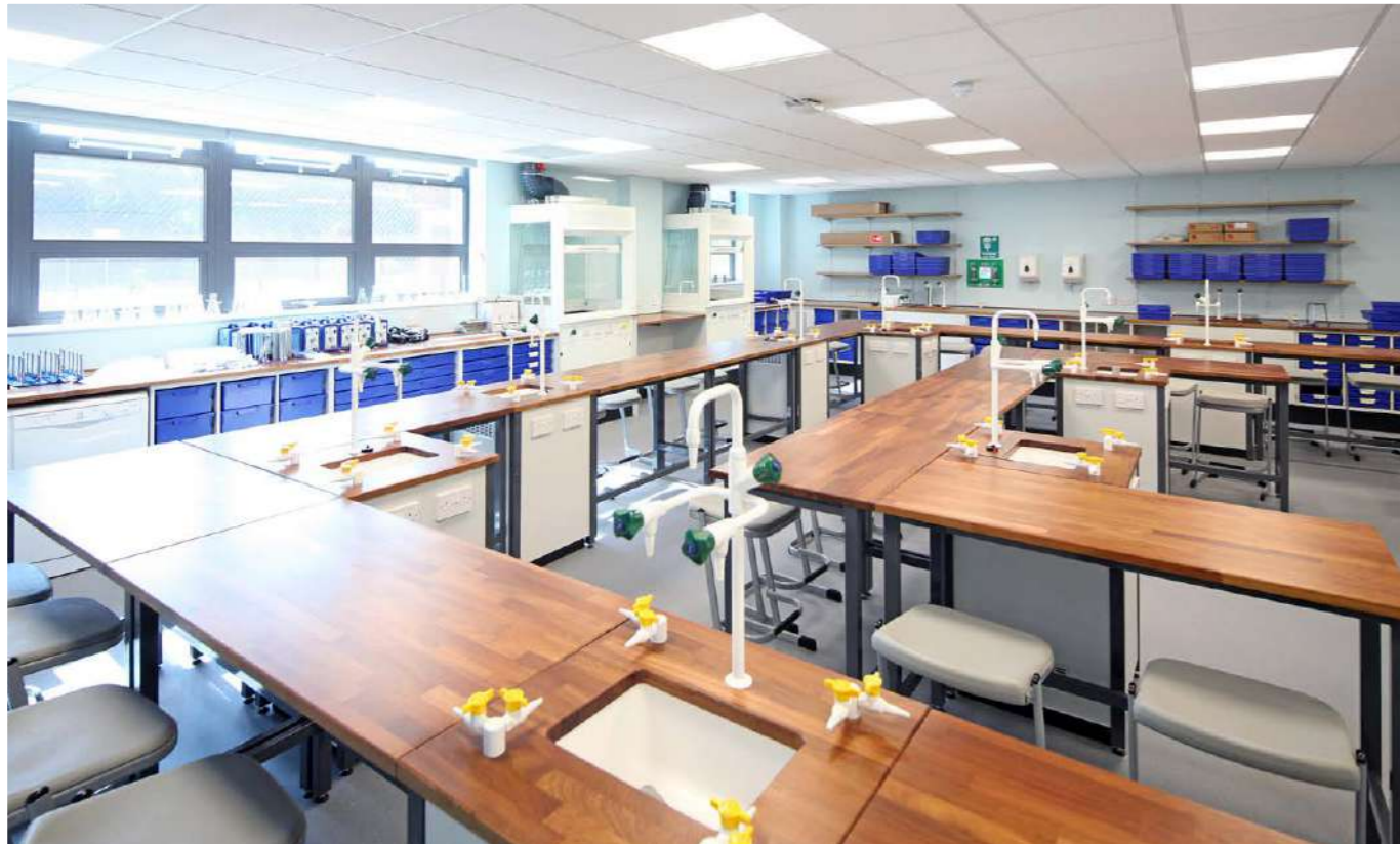
Alcester Grammar School

Our track record of being open and engaging with the project team enables us to get the best out of individual disciplines and deliver excellent outcomes.