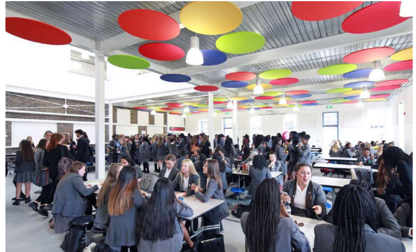
Townley Grammar School

This implementation of our quality agenda ensures our highly skilled and experienced staff have the tools to provide sound advice and deliver your objectives on time, on budget and to meet your requirements.