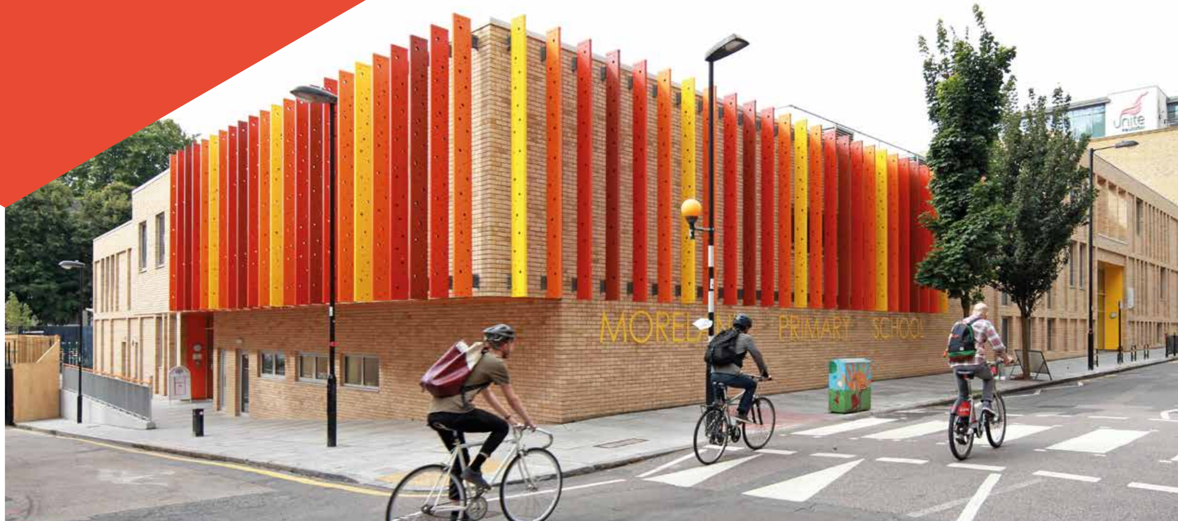
Moreland Primary School, Islington. Development of a new two form entry primary school providing capacity for 420 pupils, plus a 52 place nursery and children's centre. Architect: Haverstock

We have the ability to offer an interdisciplinary collaborative team who will simplify processes and ultimately deliver strategic plans for education providers. Whether you are looking at a simple 'one-off' repair or a whole scale redevelopment of your school we are here to help. Please just ask.