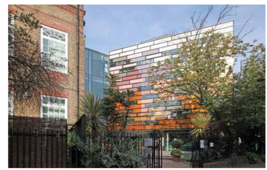
Clapham Manor Primary School. Managing repairs to curtain walling.