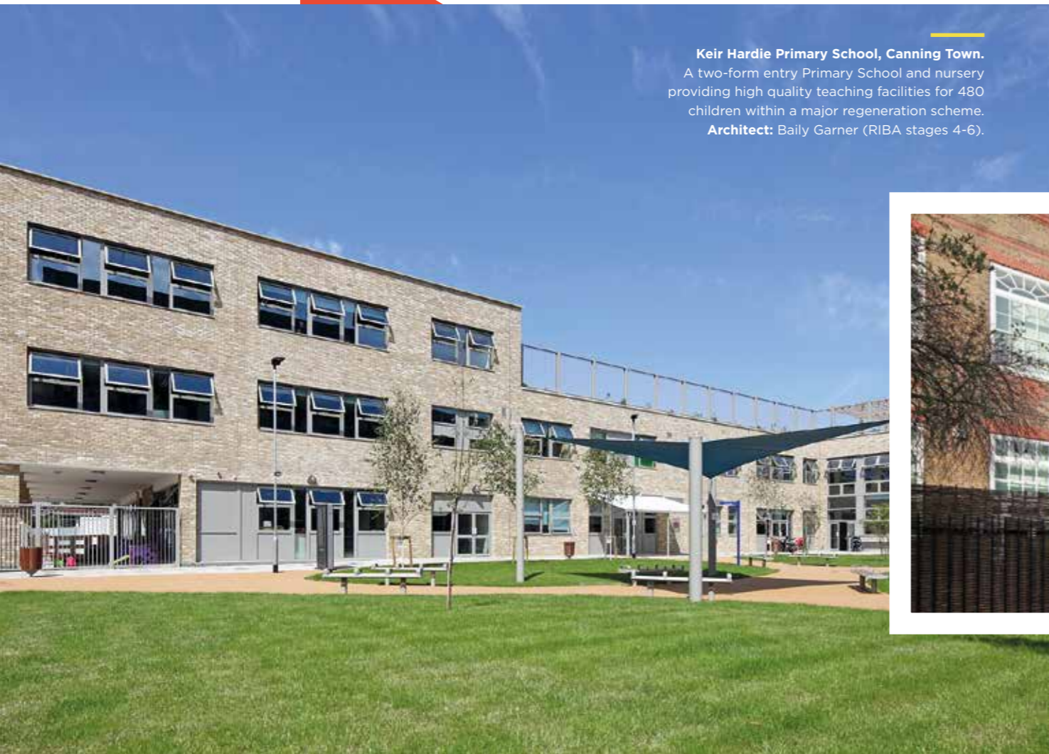
Keir Hardie Primary School, Canning Town. A two-form entry Primary School and nursery providing high quality teaching facilities for 480 children within a major regeneration scheme. Architect: Baily Garner (RIBA stages 4-6).

We feel we are best placed to deliver these tools through our interdisciplinary teams. From this solid factual understanding we can then start to strategically model what needs to be done, and identify what options are available to improve and develop your buildings.