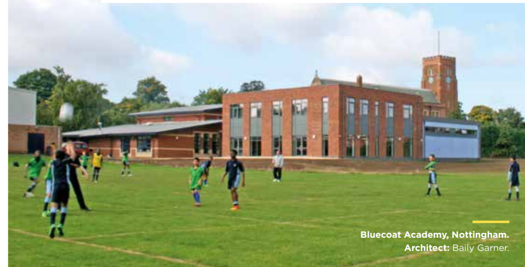
Bluecoat Academy, Nottingham. Architect: Baily Garner.