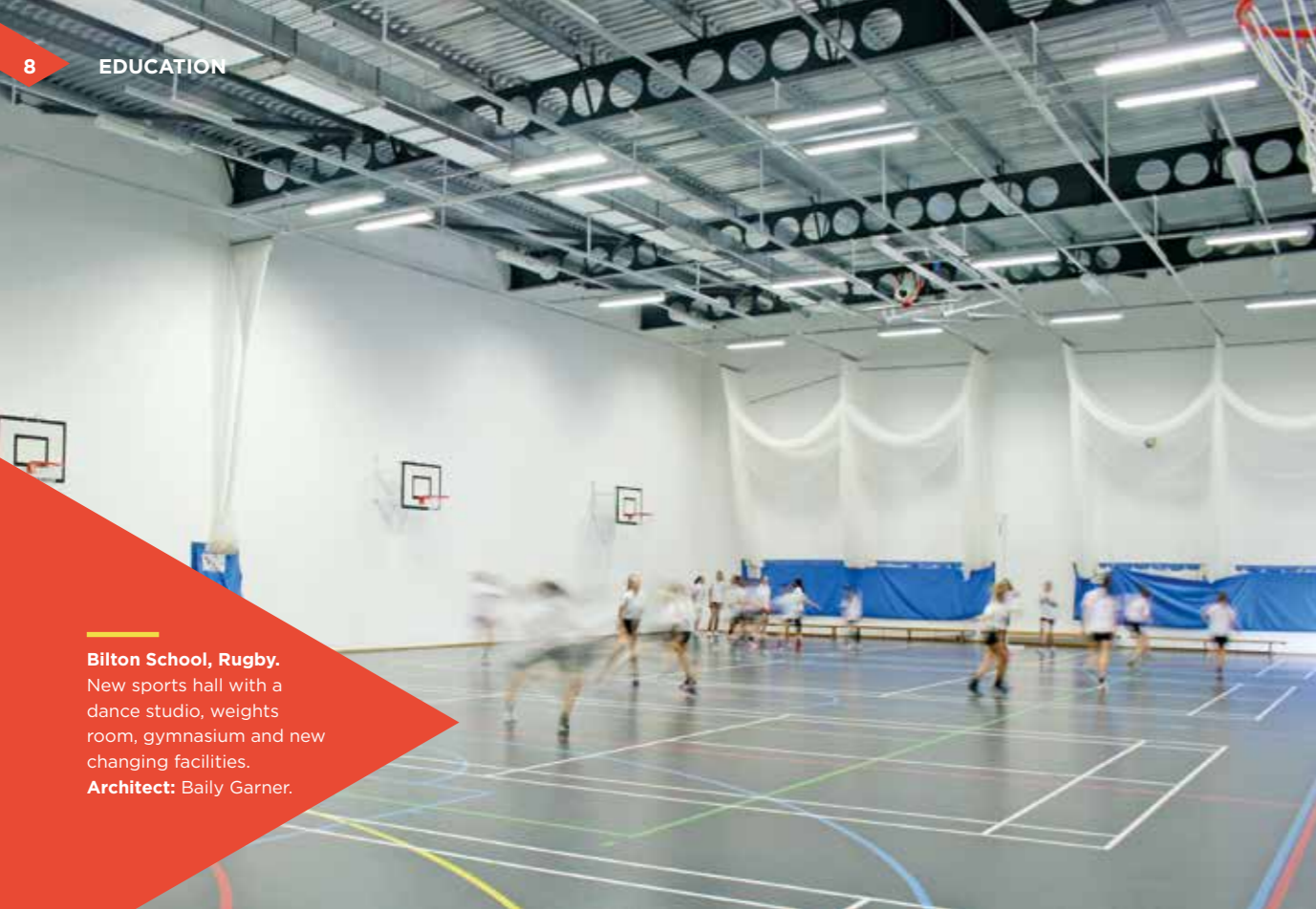
Bilton School, Rugby. New sports hall with a dance studio, weights room, gymnasium and new changing facilities. Architect: Baily Garner.