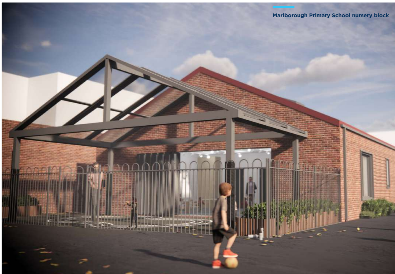
Marlborough Primary School nursery block