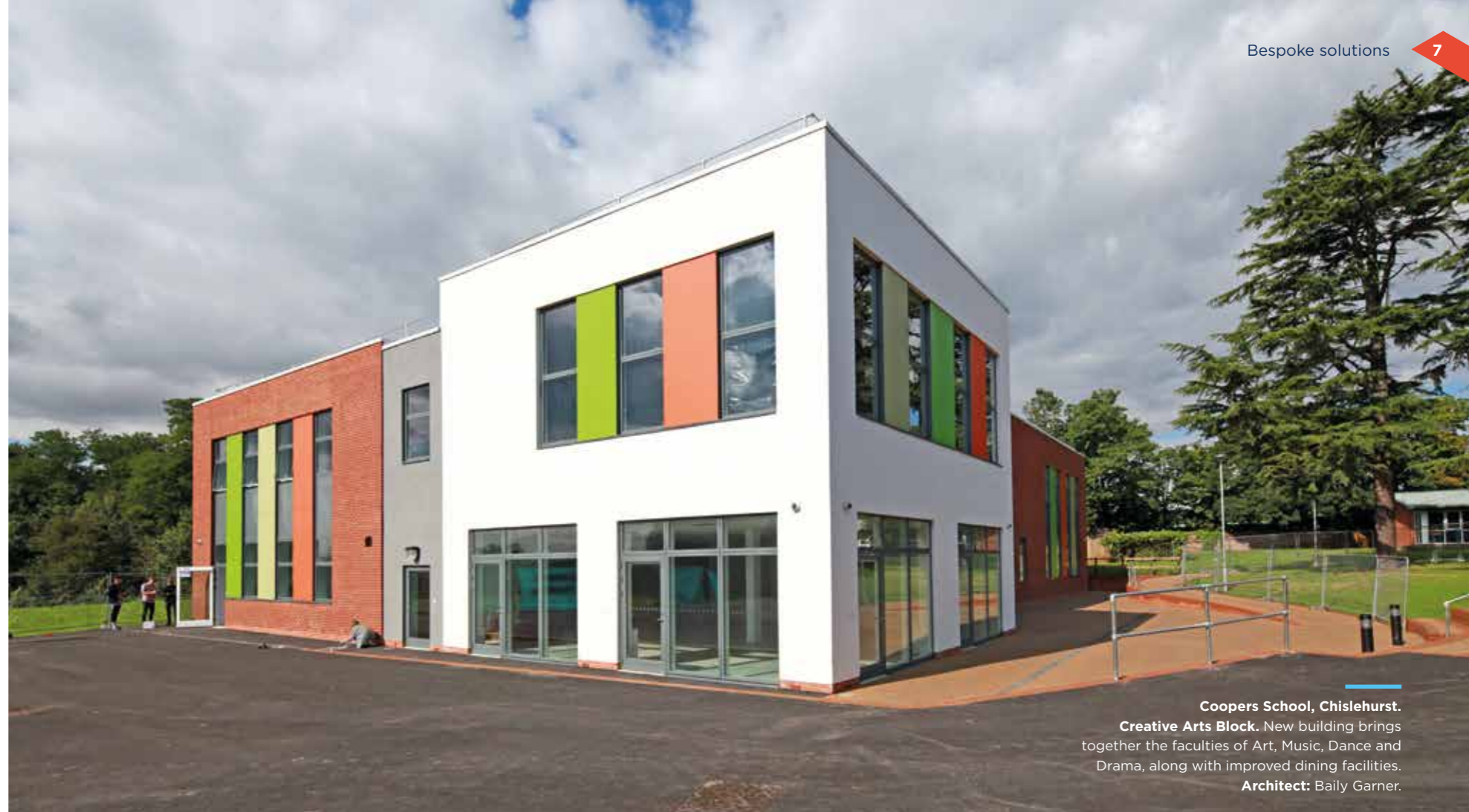
Coopers School, Chislehurst. Creative Arts Block. New building brings together the faculties of Art, Music, Dance and Drama, along with improved dining facilities. Architect: Baily Garner.

This masterplan provided Coopers School with a 10 year vision for their campus. The document collated feedback from a Condition Survey, Net Capacity Study and Consultation events to identify which buildings required investment, where additional facilities could be built and where circulation could be improved.