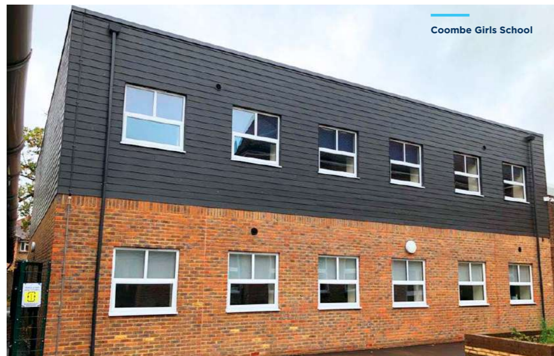
Coombe Girls School