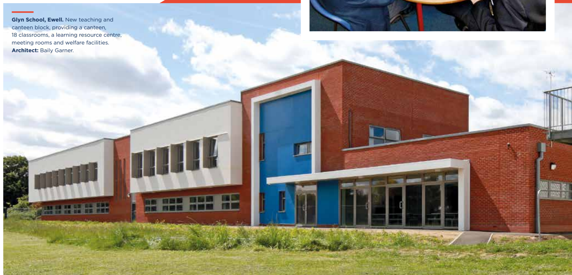
Glyn School, Ewell. New teaching and canteen block, providing a canteen, 18 classrooms, a learning resource centre, meeting rooms and welfare facilities. Architect: Baily Garner.

Our Architects worked closely with our Project Managers to implement phased completion of the works to allow the school to operate fully throughout the construction period.