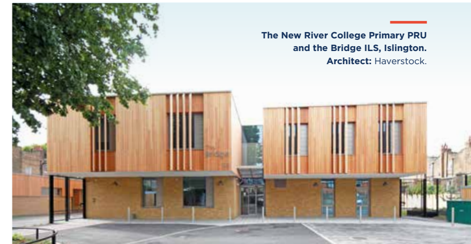
The New River College Primary PRU and the Bridge ILS, Islington. Architect: Haverstock.