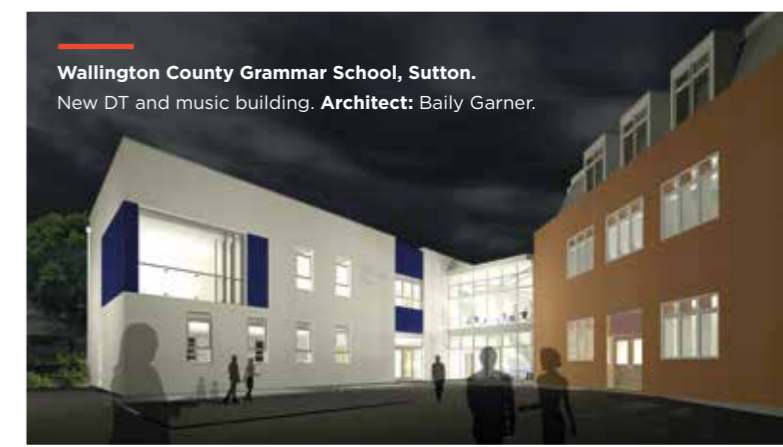
Wallington County Grammar School, Sutton. New DT and music building. Architect: Baily Garner.