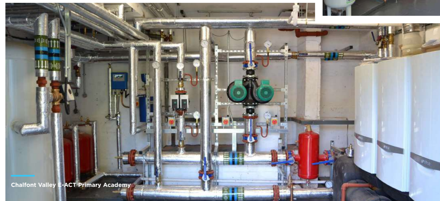
Chalfont Valley E-ACT Primary Academy