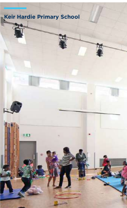
Keir Hardie Primary School

block to £100,000 refurbishment of existing toilet areas. We continue to work closely with GLF in a variety of roles, working closely with their Estates Team.